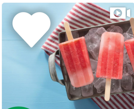
Florida Watermelon Pops