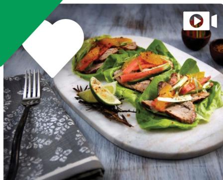
Florida Watermelon and Pork Lettuce Wraps