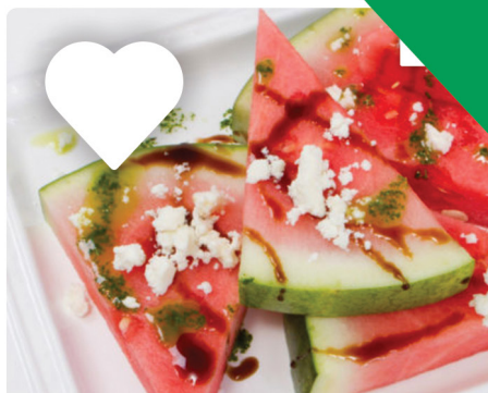
Florida Watermelon Slices with Balsamic Syrup, Mint Oil and Feta Cheese